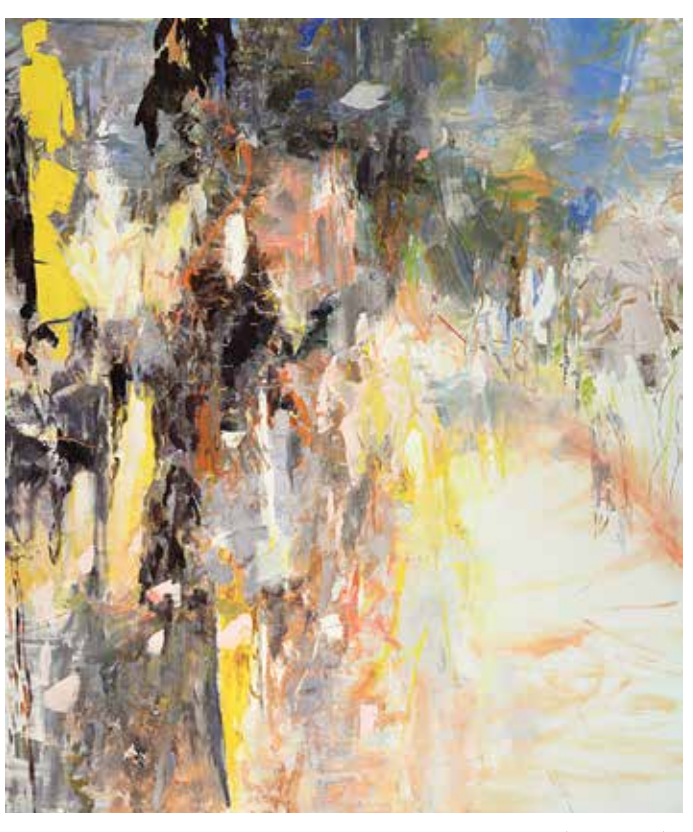
Clockwise from top left: Approach, 2012, oil on linen, 108 x 92 in.; Halcyon Falls, 2020, oil on linen, 20 x 16 in.; Wilderness Studio (Summer), 2015, oil on linen, 50 x 60 in.

returned to it in the years since. One of