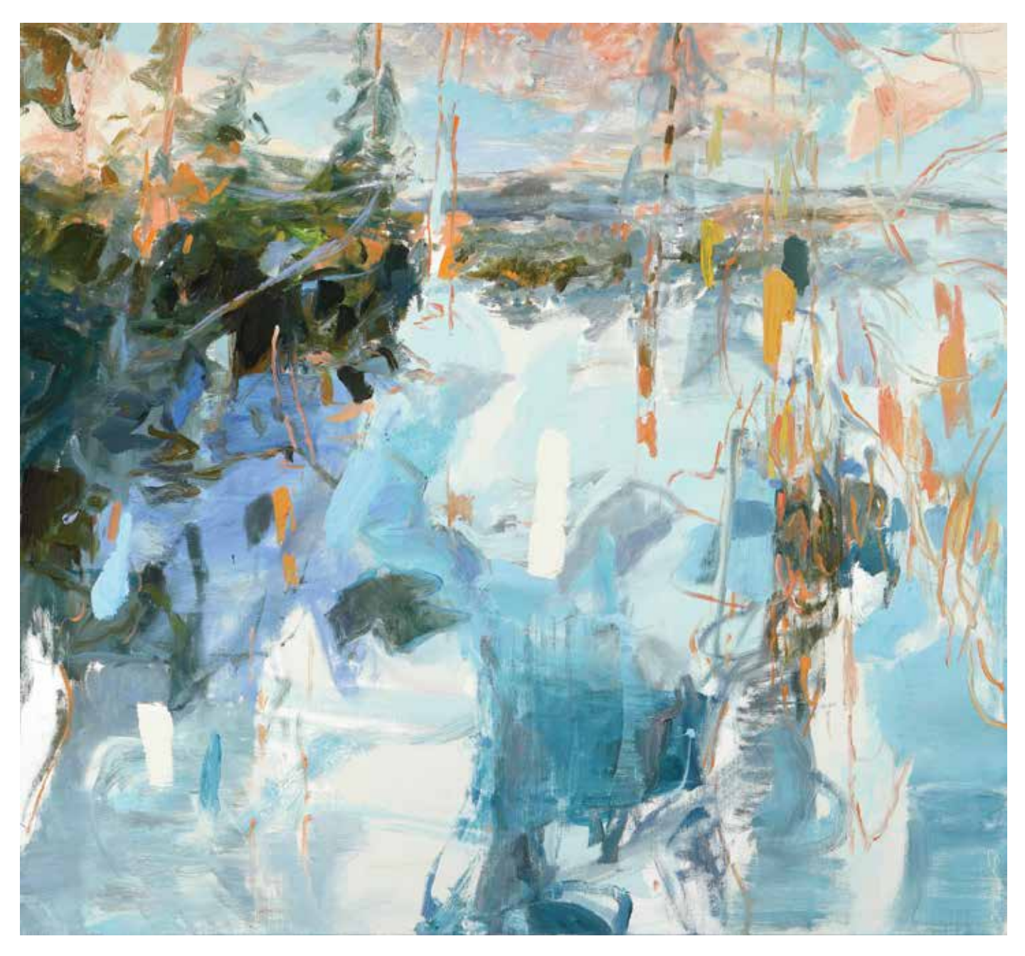
Wald, 2014, oil on linen, 48 x 52 in.