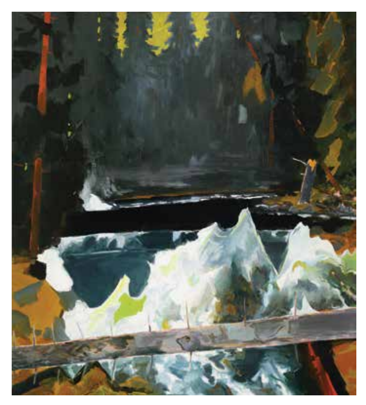
Clockwise from top left: Portage, 2019-20, oil on linen, 78 x 70 in.; Rapids and Fallen Tree, 2020, oil on linen, 78 x 70 in.; Figures in a Landscape, 2015, oil on linen, 50 x 60 in.

space and by beauty." He points out that it can happen in dramatic places like Niagara Falls or in more ordinary ones. "I've felt that speechlessness and shock and body buzz just standing in front of a field of flowers in a hemlock forest. It's the body connecting to that telluric pulse; it's both real and imaginary. I've also had that feel-