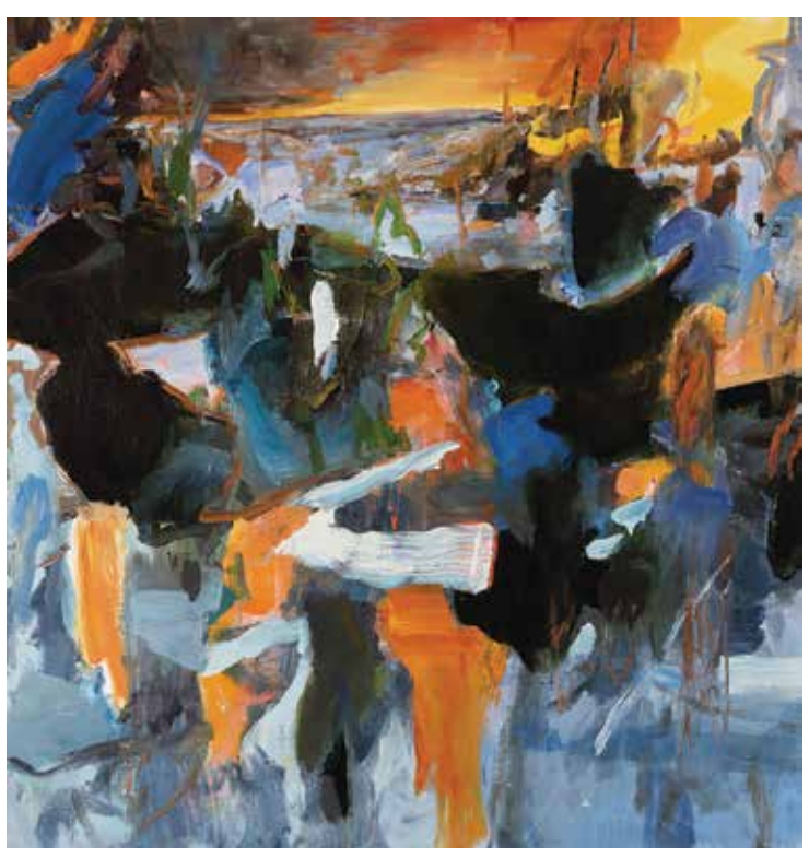
Clockwise from top left: Interior, 2020, oil on linen, 60 x 50 in.; Ruralia, 2015, oil on linen, 52 x 48 in.; Incident Two , 2014, oil on linen, 48 x 52 in.

shaded by dense growth of trees. "They're dark worlds but not black holes—they're worlds of less light," Aho says. "These aren't rivers seen from a bridge or public overlook. They're private places in the woods which I've discovered. The river had to find its way, much like the process of the painting. The river just pushes its way. Metaphorically, it feels akin to the path of one's life."